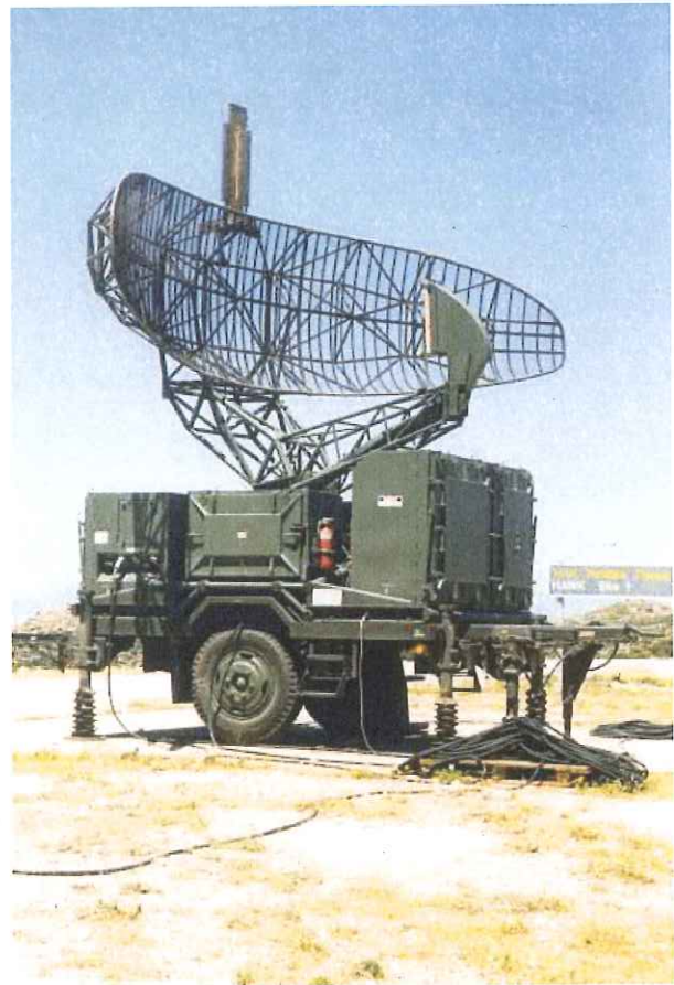
FIGURE 1 – Example of HAWK radar: the PAR (Pulse Acquisition Radar). [Color figure can be viewed in the online issue, which is available at www.interscience.wiley.com .]

In parallel, for all professional military personnel who died between the first day served in radar or in control battalions and December 31, 2004, we tried to identify the first degree family members. A questionnaire was sent to them in order to know the likely cause of death. The letter stated that the motive for obtaining this information was a study on causes of death of Belgian